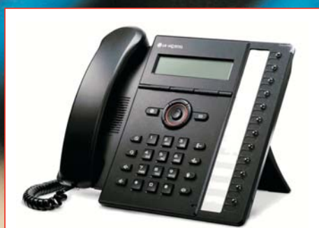
Telephone Products &amp; Accessories