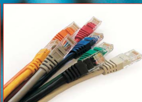
Network &amp; Computer Accessories