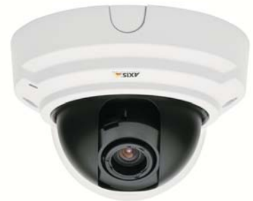
IP Surveillance Camera Systems